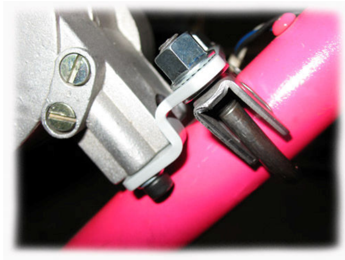
This method allows the most space savings