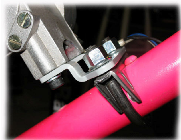
This method is used if your frame requires a longer mount